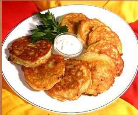
Deruny (Ukrainian Potato Pancakes)