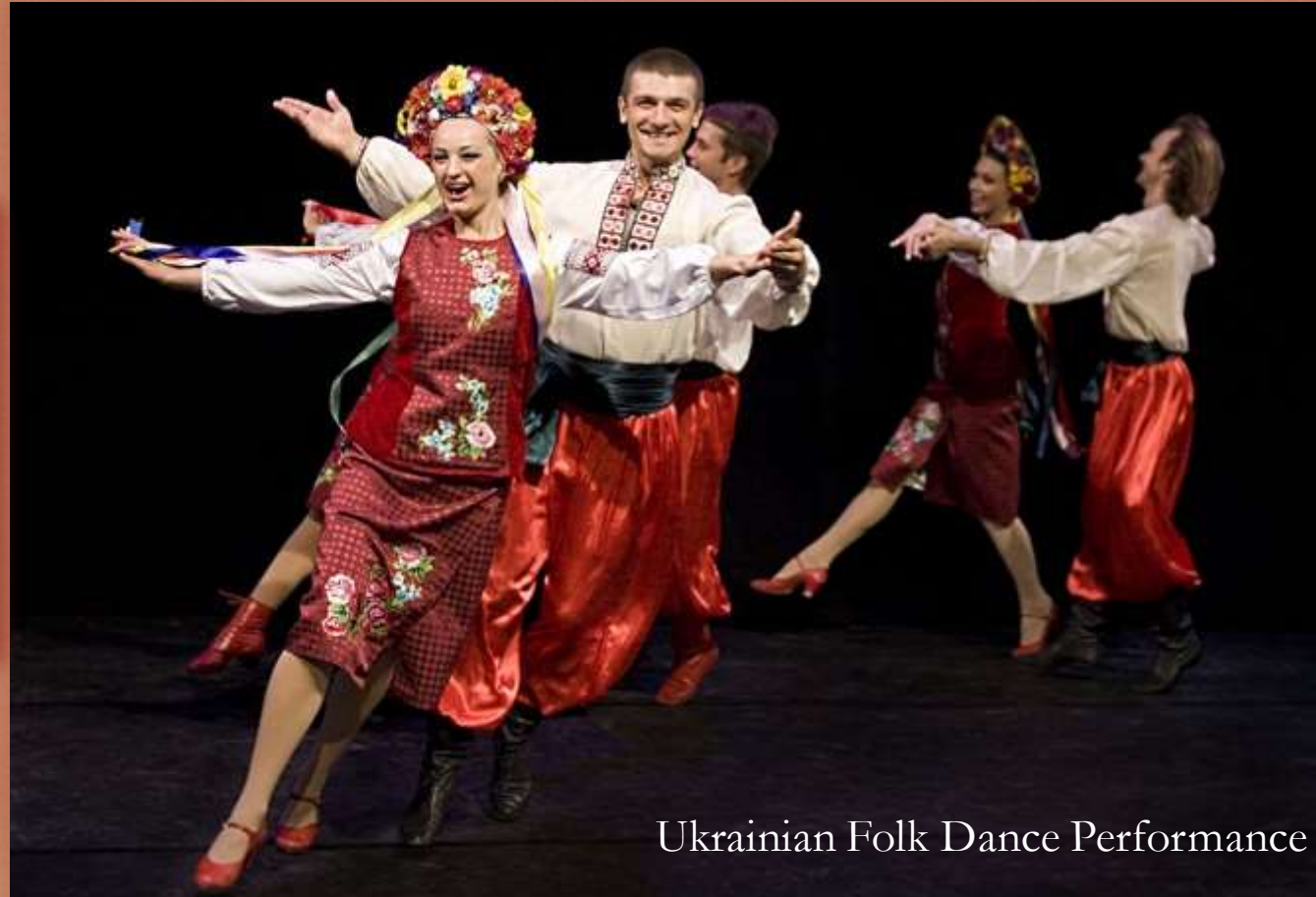
Ukrainian Folk Dance Performance